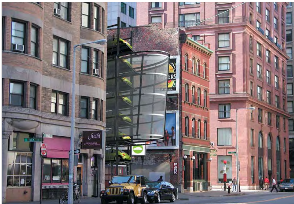
This design by Boston-based Moskow Architects for a Zipcar Dispenser in the city, which would stack cars in mechanisms above unused alleys while employing the machinery's scrim-like designed surface for advertising, is one of six winners the Boston Society of Architects' Unbuilt Architecture Design Award.